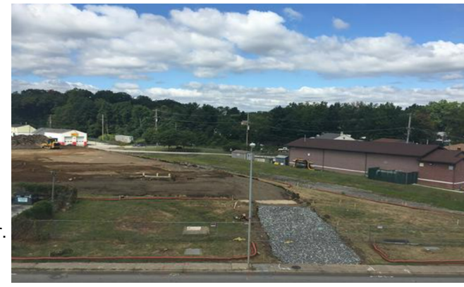
Above: Havertown PCP Superfund Site

Haverford Township Free Library 1601 Darby Road Havertown, PA 19083 (610) 446-3082