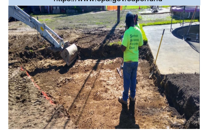
Above: Soil excavation at one of the affected properties August 2020